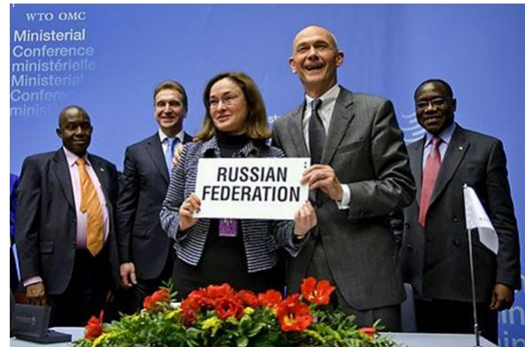
The WTO accepted Russia to its company.

commerce and free trade. A civil society built on the rule of law, transparency and participation will, in most cases, also be open for business and encourage movements of goods and services.